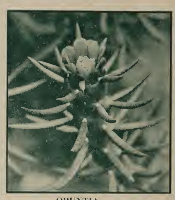
OPUNTIA An interesting cactus low in scale of evolution. Hence the leaf